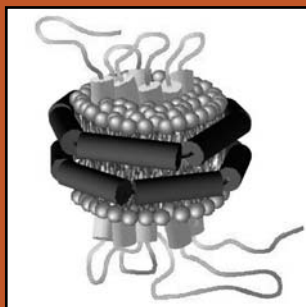
Adrenergic G-protein coupled receptor functionally solubilized by self-assembly into a 10 nm diameter Nanodisc.

led them to engineer an environment that mimics the cell membrane, where membrane proteins are found. This engineered environment is formed by combining scaffold proteins with phospholipids to form a nanoscale disc, which looks in Sligar's words, "like sushi." The phospholipids form a bilayer just like they do in a cell membrane. The water-friendly face of the encircling membrane scaffold protein points out and the lipid-friendly face of the helix nestles up against the non-polar part of the lipids.